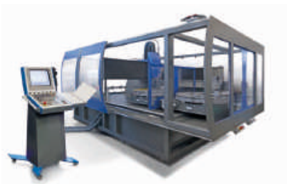
Rotary table, thus providing two autonomous work zones

Based on more than 30 years experience, we always find the optimal solution for your particular requirements and also offer customized designs: