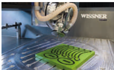
5D milling with rotating spindle and rotary table