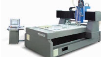
Modular Performance Concept: highly dynamic HSC router with Linear Drive Technology