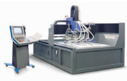
Work Centers with up to 15 spindles