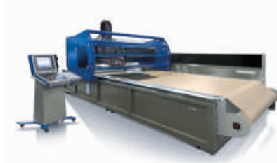
Moving enclosure and automatic feed