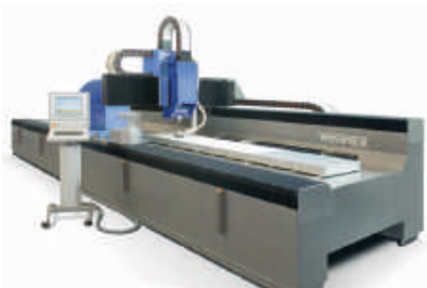
Linear Motor driven machine with cutting speed up to 120 m/min